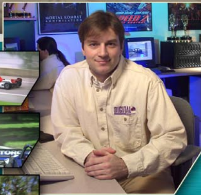
Two-Time Emmy Award Winner, Benoit Girard - Digital Dimension

Our new VideoRack LP packs up to 300 GB of high-performance video storage in a 1U (1.75") rack mountable enclosure and looks like a single SCSI drive to your NLE system – simply format VideoRack LP and you're ready to edit. Over 1 terabyte (1,000 GB) of storage can be configured in only 7 inches of rack space – that's 14 hours of uncompressed video footage! VideoRack LP sustains 65MB/second, is compatible with the leading NLE gear and comes with a 5-year factory warranty. VideoRack LP, a rack you can be proud of – in both its performance and its good looks.